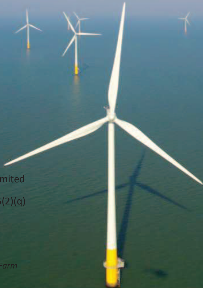
Photo: Kentish Flats Offshore Wind Farm

Date: June 2018 Revision: Version 1 Author: BECG